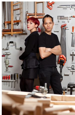
WAI & LANZAVECCHIA PORTRAIT

PLEASE GO TO WWW.TIMETODESIGN.EU TO DOWNLOAD PRESS MATERIAL