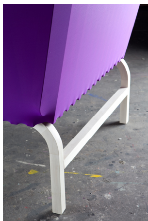
SPAZIALE SERIES BY WAI & LANZAVECCHIA CHAIR DETAIL