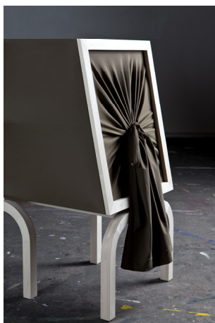
SPAZIALE SERIES BY WAI & LANZAVECCHIA COMMODE DETAIL